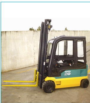
Wide choice of accessories