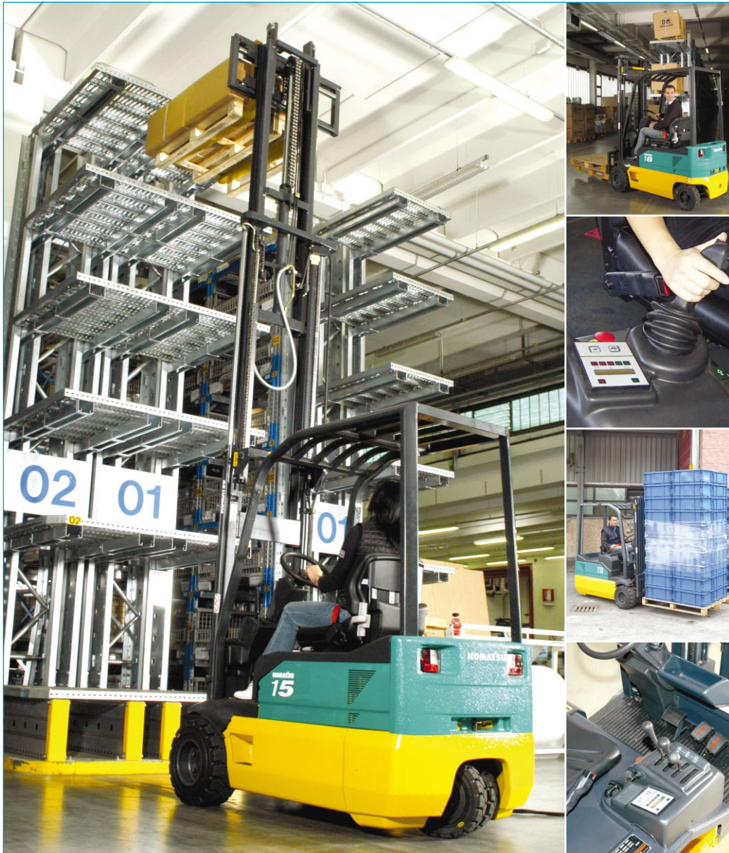
Electric Three and Four Wheeler Forklift trucks 48 Volt