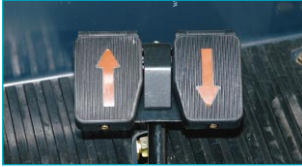
Choice of controls